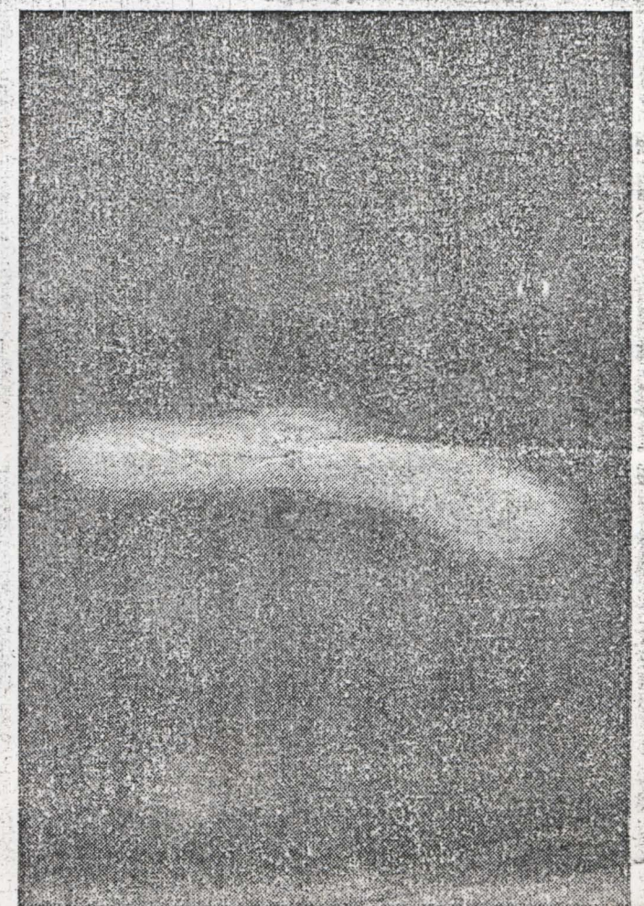
'Grapefruit, flashing lights and cigars' . . . the mysterious wave of flying saucers